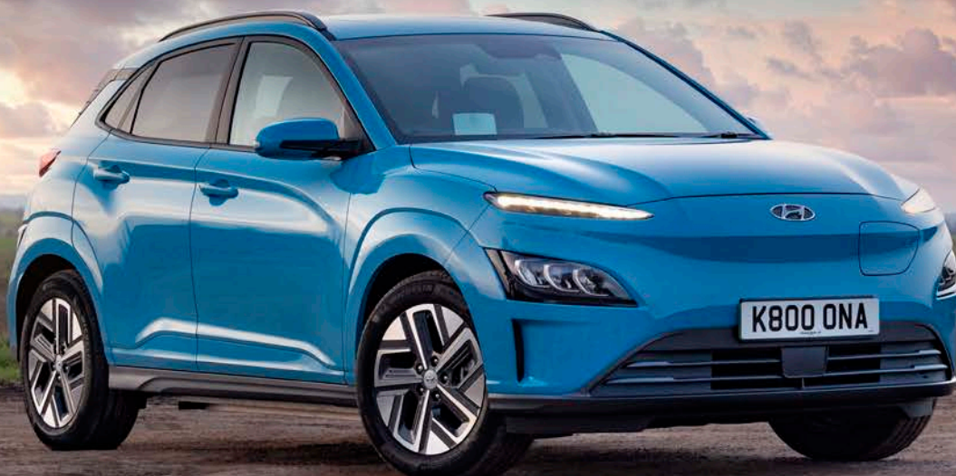
A Hyundai Kona Electric is a popular choice for first-time electric car buyers. It comes with a great battery range and is very simple to drive

An average electric car, such as the Renault Zoe, has a 52kWh battery, so would be capable (in theory) of powering the heater for 52 hours. Instead it is used to power a motor which will take the Zoe for 242 miles. That means it uses 0.21 kWh per mile – which is its measure of efficiency, in a similar way to miles per gallon in a petrol car. The kW can also indicate how fast a car will charge and how much it will cost. In its simplest terms, compare a 2kW 'granny charger' to a 150kW rapid charger and you can guess how long it will take to fill a 100kWh battery. If you are paying 28p per kWh for your electricity at home, a full charge of 50kWh on your Zoe will cost you £0.28 \times 50 = £14 .