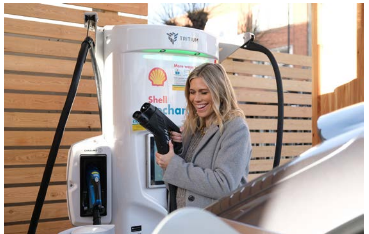
East-to-use rapid chargers like these new 175kW units at the Shell Recharge hub in London can recharge your electric car within minutes

The most common rapid chargers in the UK are 50kW units, with thousands dotted around the network. A Volkswagen ID.3 48kWh will take around 45 minutes to charge from 10 to 80 percent with one of these. Finally, we have what are called destination posts. They're often found in public car parks, supermarkets and workplaces. You'd usually use one of these points if you're planning to be away from your car for a few hours. So if you're at work or doing a spot of retail therapy, these are perfect. These use an AC connector, so make sure you have your cables with you.