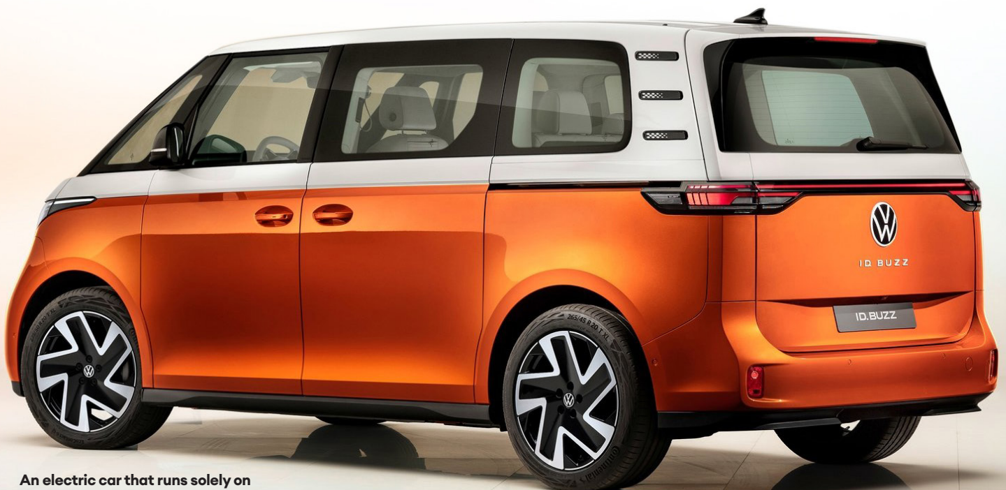
An electric car that runs solely on batteries is often referred to as a BEV, or Battery Electric Vehicle

The good news is that the power packs in a modern electric car are designed to be harder than the batteries in a phone, and should be able to provide a useful range for the lifetime of the car. You can check the condition of your battery by looking at the State Of Health (SOH) either in the car's menu, via a special app (such as LeafSpy) or by asking the dealer at a service. Once the car is getting old, the packs can be reused for home or industrial power storage and still have a value.